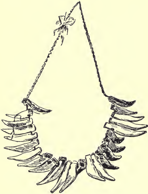
RECORD ORNAMENT OF IMITATION LEOPARD TEETH FROM FROBENIUS. CHILDHOOD OF MAN, p. 27.